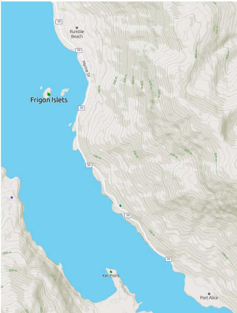
The name Frigon Road is in honour of early Port Alice settler Ned Frigon.